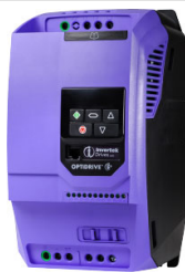
7.5HP VFD for 60GPM Pump Indoor

Since 2009, we have been supplying portable and stationary pumps for moving all types of oil. Oil cleaning centrifuges are also important tools to re-use oil as fuel or lubricant.