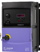
7.5HP VFD for 60GPM Pump Outdoor

Since 2009, we have been supplying portable and stationary pumps for moving all types of oil. Oil cleaning centrifuges are also important tools to re-use oil as fuel or lubricant.