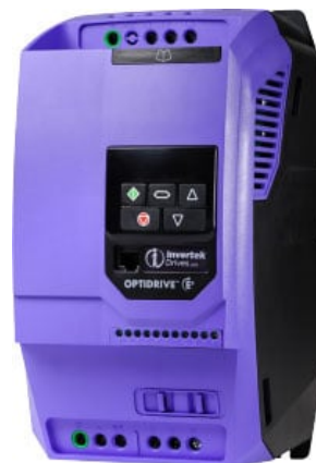
7.5HP VFD for 60GPM Pump Indoor