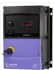
7.5HP VFD for 60GPM Pump Outdoor