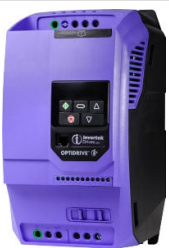
7.5HP VFD for 60GPM Pump Indoor