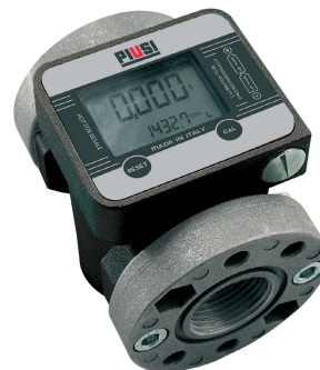
15 GPM Digital Oil Pump Flow Meter 1"