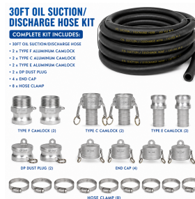
30ft Aluminum Camlock Hose Kit