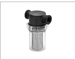
In Line Suction Strainer 1"