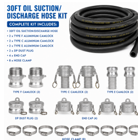
30ft Aluminum Camlock Hose Kit