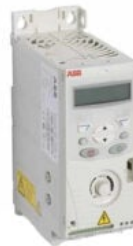
1.5HP ABB ACS 150 VFD