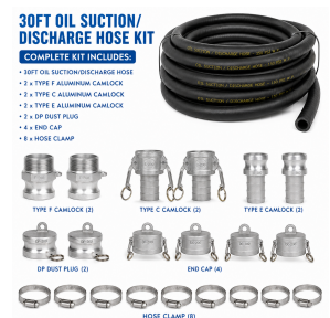
30ft Aluminum Camlock Hose Kit

Since 2009, we have been supplying portable and stationary pumps for moving all types of oil. Oil cleaning centrifuges are also important tools to re-use oil as fuel or lubricant.