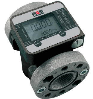
15 GPM Digital Oil Pump Flow Meter 1"

Since 2009, we have been supplying portable and stationary pumps for moving all types of oil. Oil cleaning centrifuges are also important tools to re-use oil as fuel or lubricant.