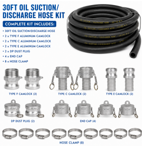
30ft Aluminum Camlock Hose Kit