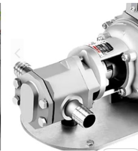
Stainless Steel 12GPM Oil Transfer Pump Head