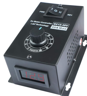
12-48v Variable Speed Controller