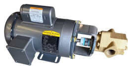
480V Oil Pump at 7GPM