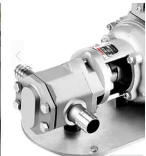
Stainless Steel 12GPM Oil Transfer Pump Head