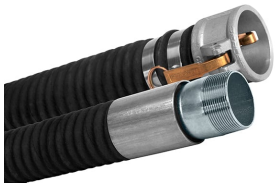
Fuel and Oil Tank Transfer Hose 1.5"