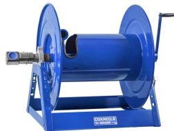
Hose Reel for Oil Transfer Hose