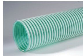
Oil Pump Vacuum Hose - 1.25 Inch