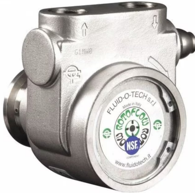
Stainless Food Grade Pump 5GPM