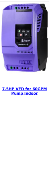
7.5HP_VFD_for_60GPM Pump Indoor