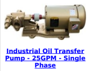
Industrial Oil Transfer Pump - 25GPM - Single Phase