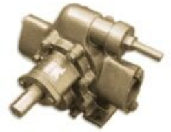
25GPM Industrial Pumphead Only

Since 2009, we have been supplying portable and stationary pumps for moving all types of oil. Oil cleaning centrifuges are also important tools to re-use oil as fuel or lubricant.