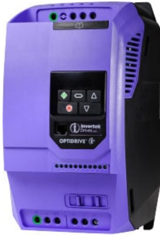
7.5HP VFD for 60GPM Pump Indoor