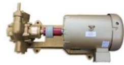
Industrial Oil Transfer Pump - 60GPM

Since 2009, we have been supplying portable and stationary pumps for moving all types of oil. Oil cleaning centrifuges are also important tools to re-use oil as fuel or lubricant.