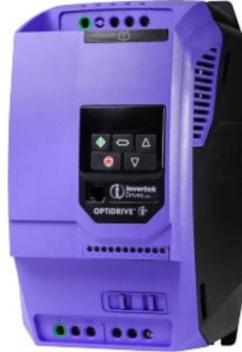
7.5HP VFD for 60GPM Pump Indoor