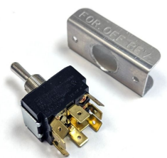
Portable Oil Transfer Pump Reversible Switch

Since 2009, we have been supplying portable and stationary pumps for moving all types of oil. Oil cleaning centrifuges are also important tools to re-use oil as fuel or lubricant.