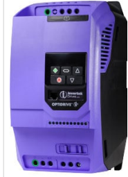
7.5HP VFD for 60GPM Pump Indoor