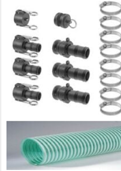
Oil Pump Hose Kit - 1.25 Inch