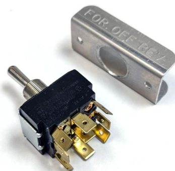
Portable Oil Transfer Pump Reversible Switch