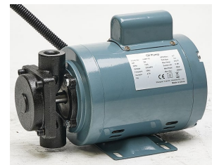
Fryer Oil Circulation Pump

Since 2009, we have been supplying portable and stationary pumps for moving all types of oil. Oil cleaning centrifuges are also important tools to re-use oil as fuel or lubricant.