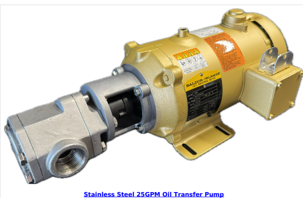
Stainless Steel 25GPM Oil Transfer Pump