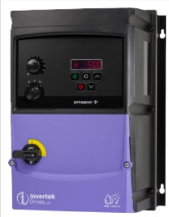
7.5HP VFD for 60GPM Pump Outdoor