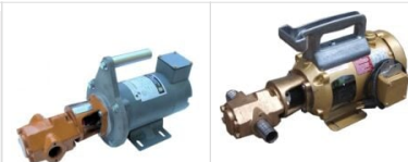
24GPM 12V Oil Transfer Pump