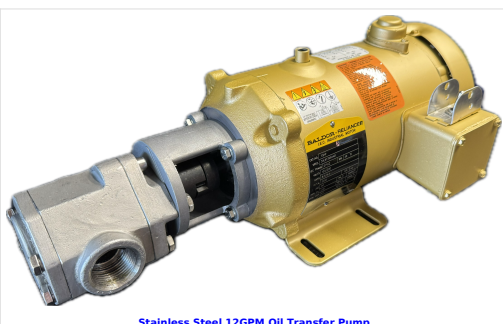
Stainless Steel 12GPM Oil Transfer Pump