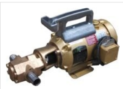
25GPM Portable Oil Transfer Pump - Massive Gears