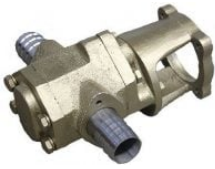
Gear Oil Pump - Pumphead Only