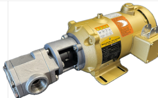
Stainless Steel 12GPM Oil Transfer Pump