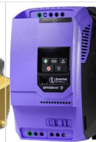
7.5HP VFD for 60GPM Pump Indoor