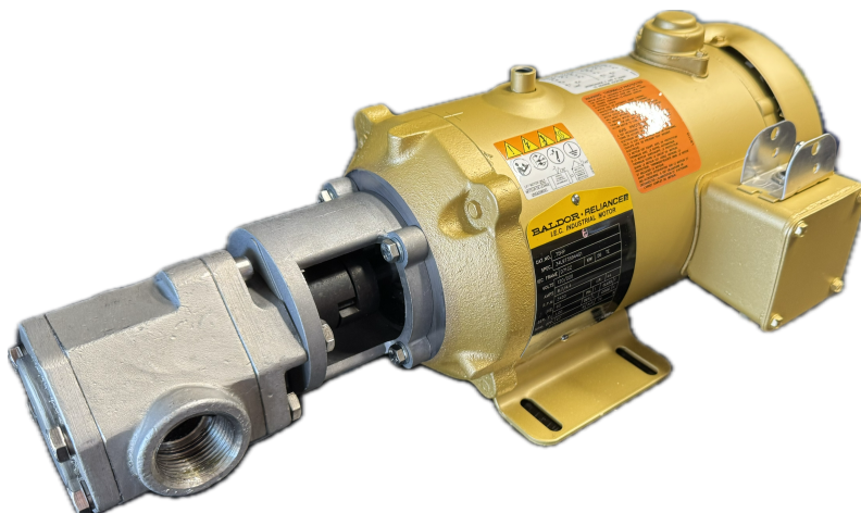
Stainless Steel 25GPM Oil Transfer Pump