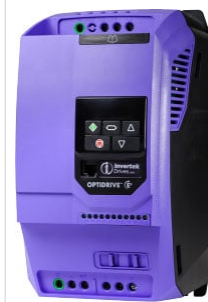
7.5HP VFD for 60GPM Pump Indoor