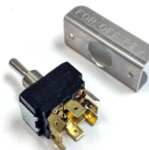
Portable Oil Transfer Pump Reversible Switch