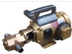
25GPM Portable Oil Transfer Pump - Massive Gears