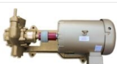
Industrial Oil Transfer Pump - 60GPM