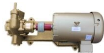
Industrial Oil Transfer Pump - 60GPM

Since 2009, we have been supplying portable and stationary pumps for moving all types of oil. Oil cleaning centrifuges are also important tools to re-use oil as fuel or lubricant.