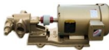
Industrial Oil Transfer Pump - 25GPM - Single Phase