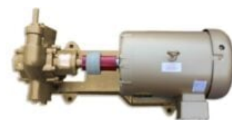
Industrial Oil Transfer Pump - 60GPM