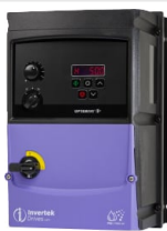
7.5HP VFD for 60GPM Pump Outdoor

Since 2009, we have been supplying portable and stationary pumps for moving all types of oil. Oil cleaning centrifuges are also important tools to re-use oil as fuel or lubricant.