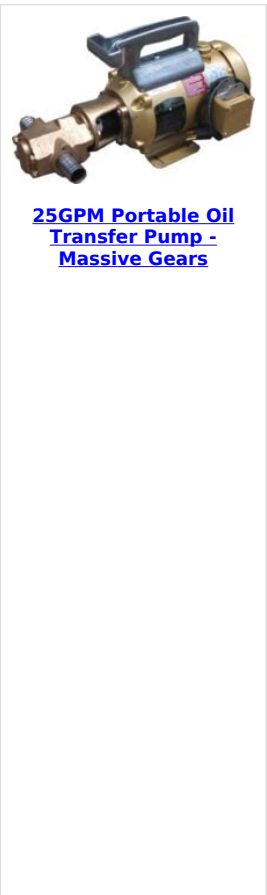
25GPM Portable Oil Transfer Pump - Massive Gears