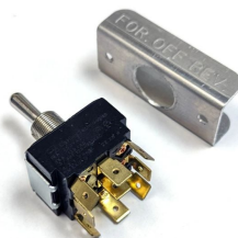
Portable Oil Transfer Pump Reversible Switch