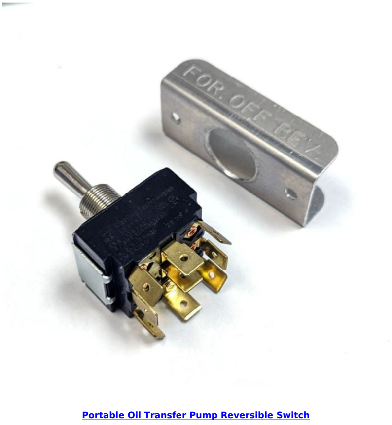
Portable Oil Transfer Pump Reversible Switch