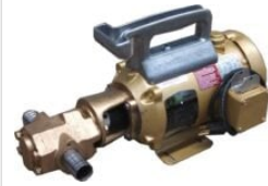
25GPM Portable Oil Transfer Pump - Massive Gears