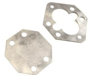
Portable Pumphead Replacement Gasket

Since 2009, we have been supplying portable and stationary pumps for moving all types of oil. Oil cleaning centrifuges are also important tools to re-use oil as fuel or lubricant.