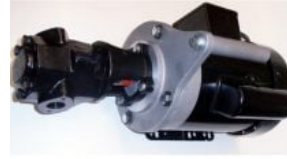
50Hz Oil and Diesel 80 liters/min