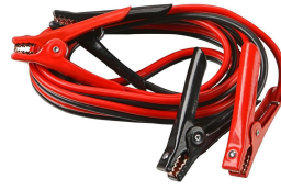
12V Cables with Alligator Clamps