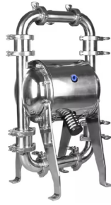
Sanitary Diaphragm Pump - Stainless