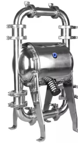
Sanitary Diaphragm Pump - Stainless