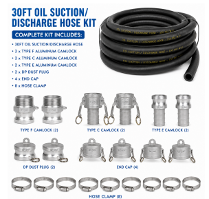
30ft Aluminum Camlock Hose Kit

Since 2009, we have been supplying portable and stationary pumps for moving all types of oil. Oil cleaning centrifuges are also important tools to re-use oil as fuel or lubricant.