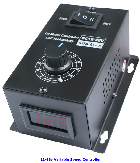
12-48v Variable Speed Controller