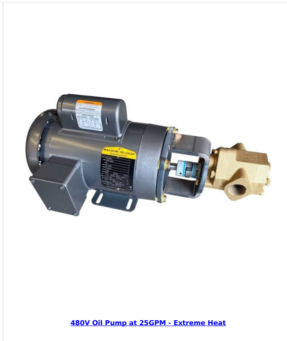
480V Oil Pump at 25GPM - Extreme Heat